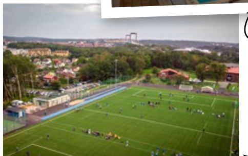
Football field with artificial turf.