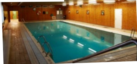
Our heated swimming pool.