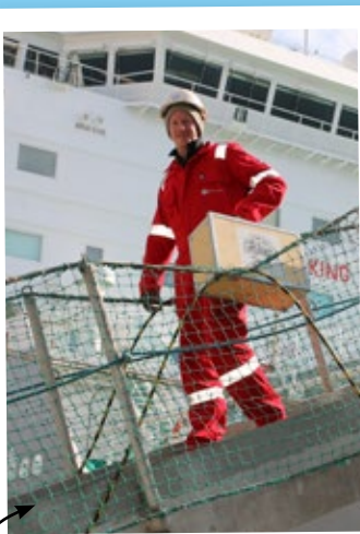
The Swedish Seamen's Library is located right next to Rosenhill.