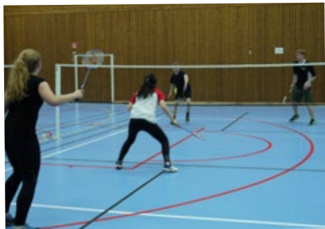
Badminton in our full-size indoor sports hall.