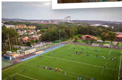
Football field with artificial turf.