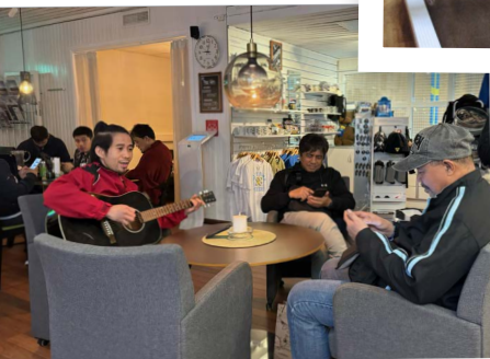
Chilling in the cafeteria.