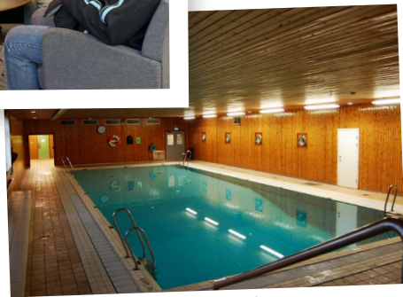
Our heated swimming pool.