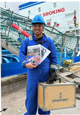
The Swedish Seamen's Library is located right next to Rosenhill.